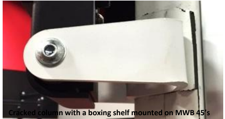
Cracked column with a boxing shelf mounted on MWB 45's

Using the Plyometric Platform or the Boxing Shelf on the corner mounted Mini Wall Bar 45's (MWB 45's) can cause the column to crack at the mounting point of the MWB.