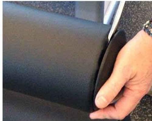
Apply pressure on cover while using screwdriver to help snap remaining connections iinto position.