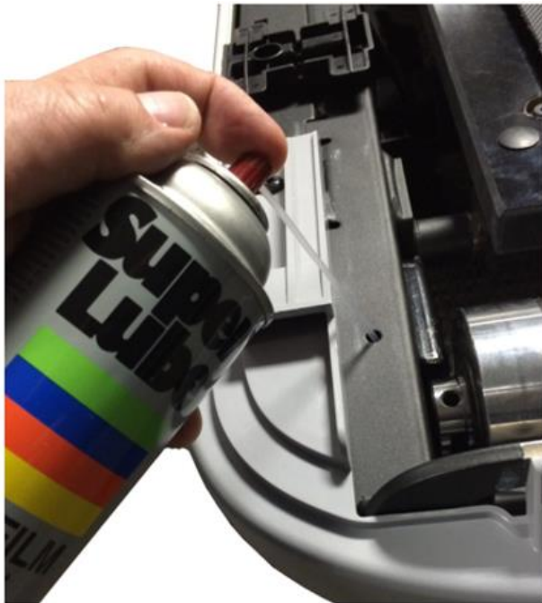
Apply lubricant through the frame rail access hole.